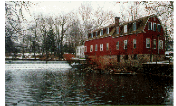
Droescher's Mill—Cranford, NJ

Join expert RRA birders on a nighttime tour of Rahway River Park! This is the best time of year to search for owls. During our exploration, we learn more about the Screech and Great Horned Owls that live in this urban nature preserve. Bring binoculars and a flashlight. Dress in layers! Meet at the Ulrich Pool parking lot.