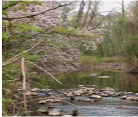
Tranquil Spring Scene along the Rahway River in South Mountain Reservation

Join the Rahway River Association this year as we teach you where to find and how to create natural wonderlands in your own back yard!